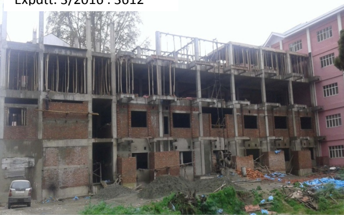
Block "B" District Hospital Works Anantnag.

Estd. Cost : Rs 5950 lacs Expdtt. 3/2016 : 3612