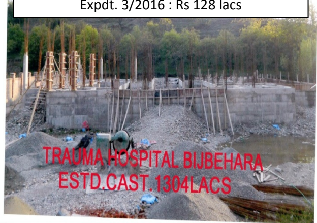
TRAUMA HOSPITAL BIJBEHARA ESTD.CAST. 1304LACS

Estd. Cost: Rs 1304 lacs Expdt. 3/2016 : Rs 128 lacs