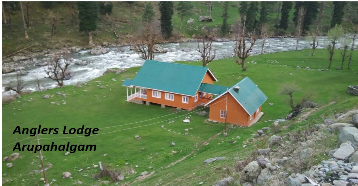
Anglers Lodge Arupahalgam